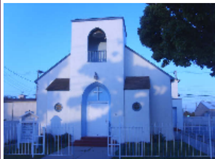
Salinas FWB Church